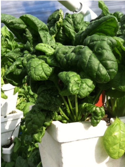
Figure 1. Spinach growing in a vertical tower system.

solution culture. Creating successful production systems has been a challenge for greenhouse and outdoor growers alike. The use of baby spinach crops, as mentioned above, is one successful technique for cropping to a harvestable stage before Pythium has the opportunity to overcome the plants (Brechner and deVilliers 2012). Growers should carefully consider which hydroponic method is best suitable for commercial crop production. Spinach production in deep water culture or raft culture has proven to be more problematic than media-based vertical growing systems. Regardless of the specific system utilized, once the Pythium pathogen has established itself in that system, it is difficult to successfully eradicate during the growing season.