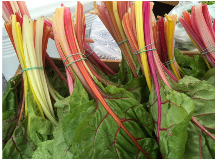
Figure 2. Market display of 'Bright Lights' chard.

Swiss chard plants are characterized by large, fleshy, dark green leaves with broad center stalks that can be white, red, orange, yellow, pink, or purple. (Figure 2).