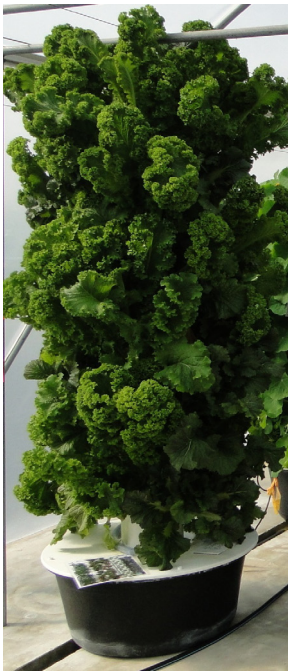
Figure 3. Curly kale variety in an aeroponic tower.

In conjunction with the rise in popularity of locally-grown, fresh produce, consumers have been demonstrating a preference for “juicing” or the extraction of liquids/nutrients from raw agricultural products. Kale, one of the top 15 powerhouse vegetables, has been a forerunner in the juicing/smoothie trend. Brassica oleracea L. (Acephala group) which is also known as “borecole,” shares the majority of the nutrient profile as the other leafy greens discussed above (Stephens 2012).