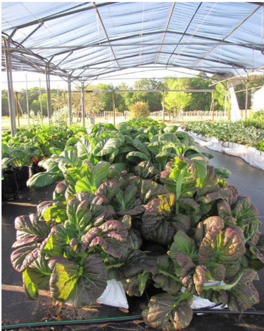
Figure 5. Multiple cultivars of mustard grown under shade outdoors.

Mustard green leaves, Brassica juncea , are known for their distinctive horseradish, hot and spicy flavor and are widely used in traditional African, Indian, Asian, and African-American cuisines. Grown in a wide array of colors from shades of green to burgundy, this member of the headless cabbage family is prized for its diverse textures, shapes, and growing adaptability. Mustards will succeed in both temperate and subtropical zones, but prefer cooler season temperatures. Susceptible to bolting in summertime or hot greenhouse conditions, mustard greens lend themselves well to the season extension strategies of high tunnels and shade systems.