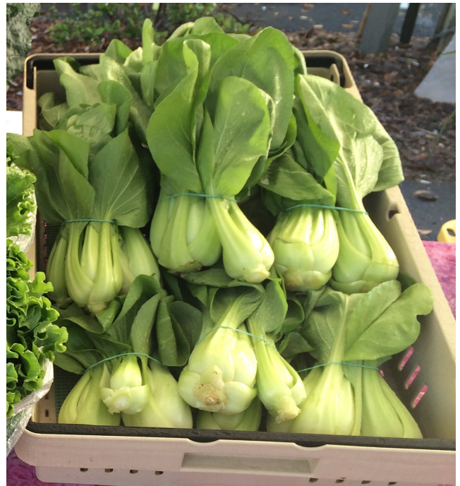
Figure 6. Baby bok choy at a farmers' market stand.

With a great tolerance for both hot and cold growing conditions and relatively rapid growth cycle, these diverse crops lend themselves to virtually all hydroponic production systems. Certain cultivars do produce more robust plants (i.e. ‘nappa’ or Chinese cabbage) than other compact types (i.e. ‘tat soi’ or spoon cabbage), but considering the diverse varieties and the mainstream acceptance in direct marketing venues, this category presents itself as an important niche for any hydroponic/protected system grower (Figure 6).