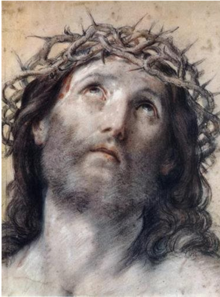
ECCE HOMO "BEHOLD THE MAN"