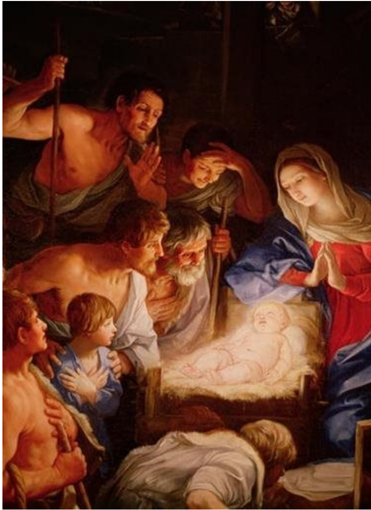
ADORATION OF THE SHEPHERDS