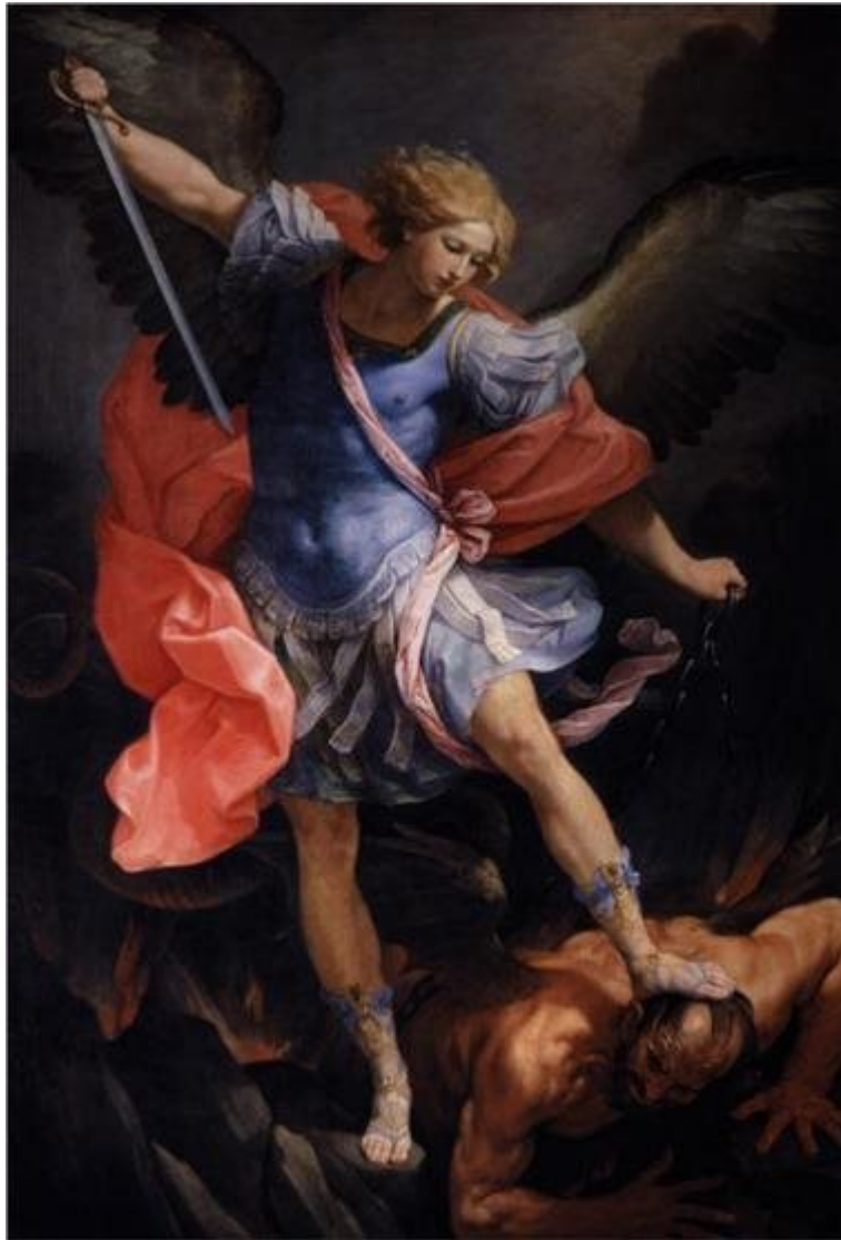
ARCHANGEL MICHAEL DEFEATING SATAN