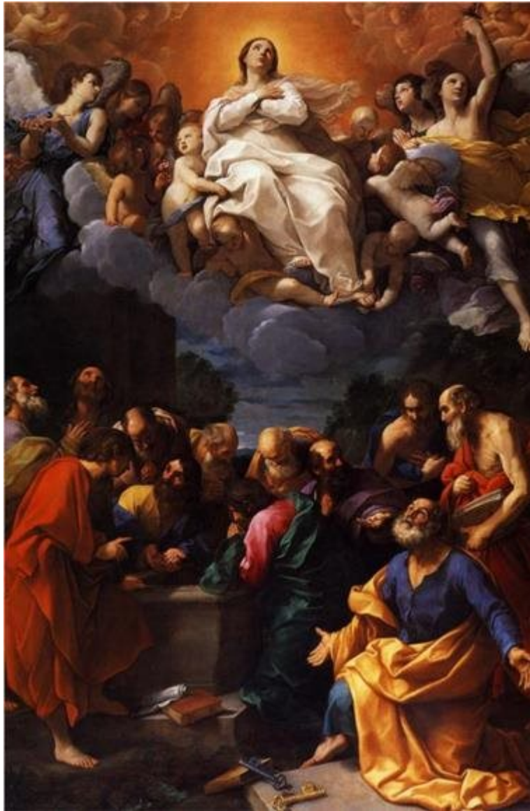
THE ASSUMPTION OF THE BLESSED VIRGIN MARY