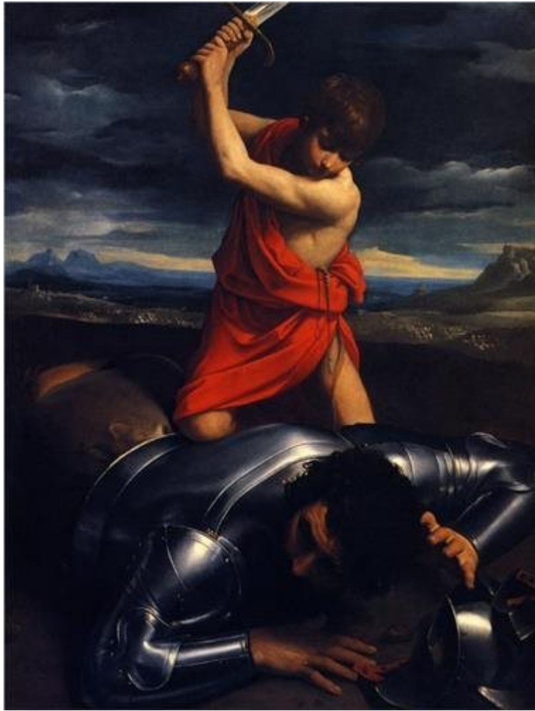
DAVID AND GOLIATH