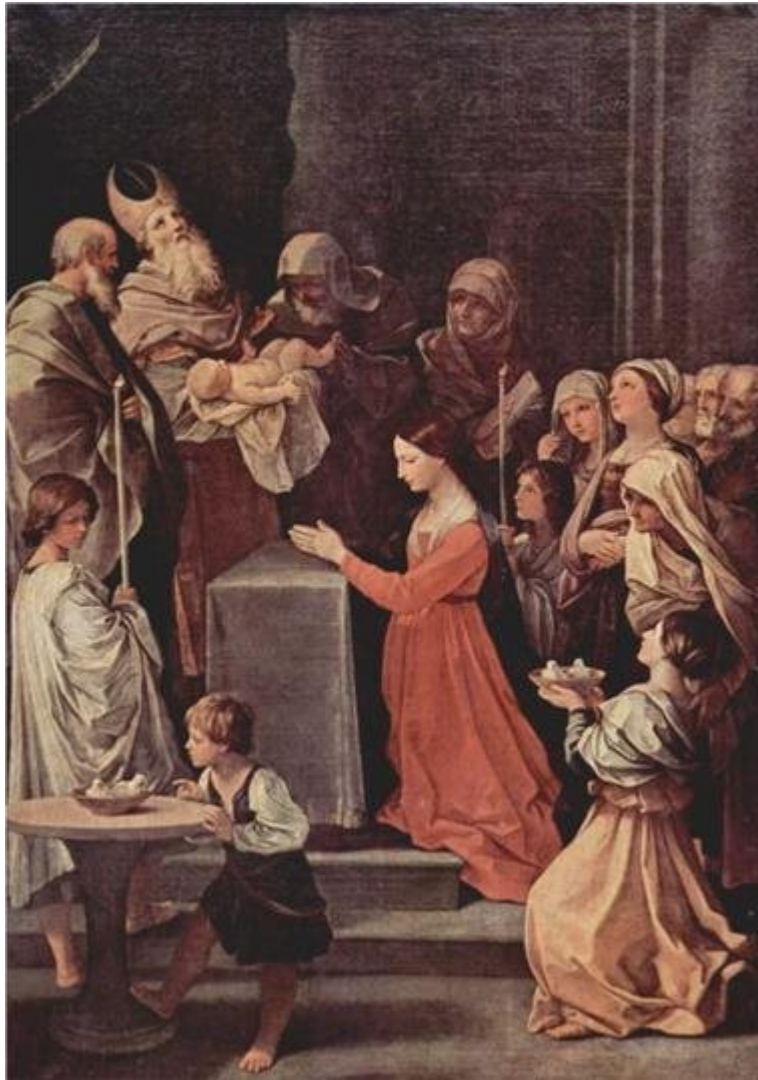
THE PURIFICATION OF THE VIRGIN