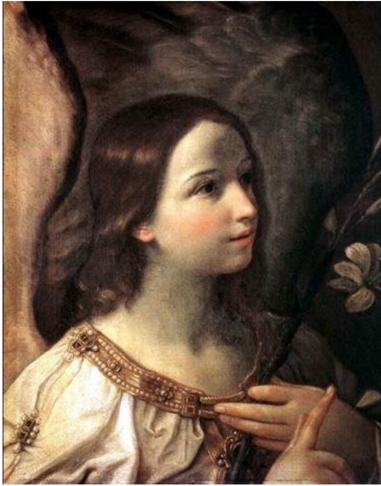
ANGEL OF THE ANNUNCIATION