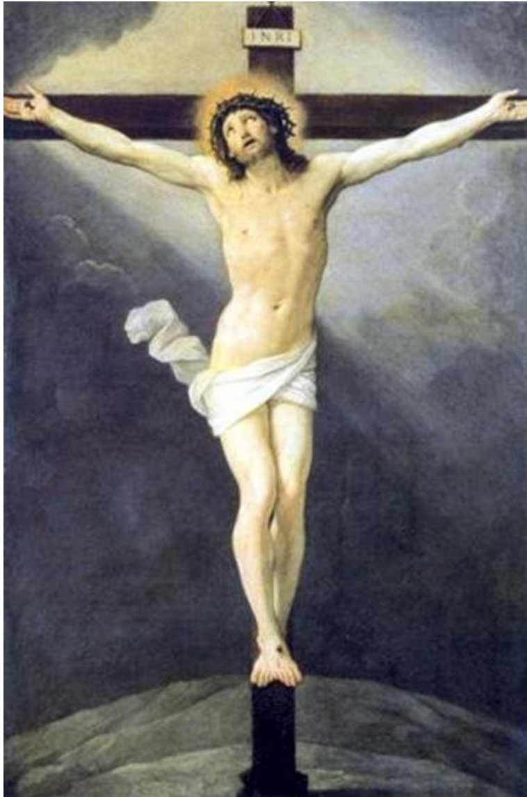
THE CRUCIFIXION OF JESUS CHRIST