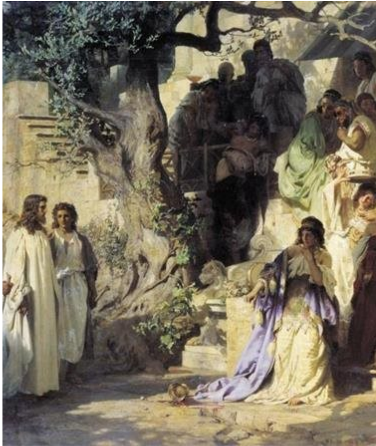
JESUS CHRIST AND THE SINNER