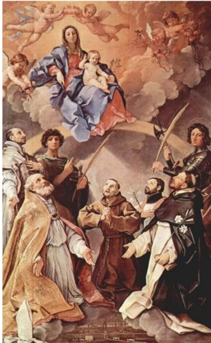
MADONNA ENTHRONED WITH THE SAINTS